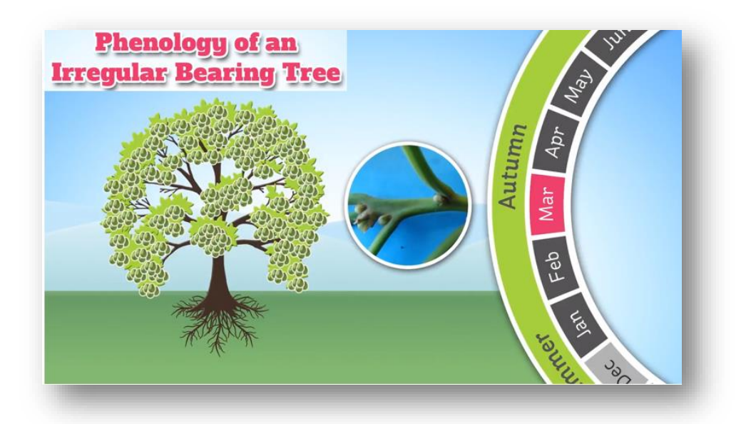
New video(s) describing the Phenology of the avocado tree to aid in best practice canopy management