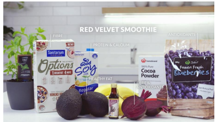
NZ partnered with the Healthy Food Guide to create eight avocado recipes for their TV show