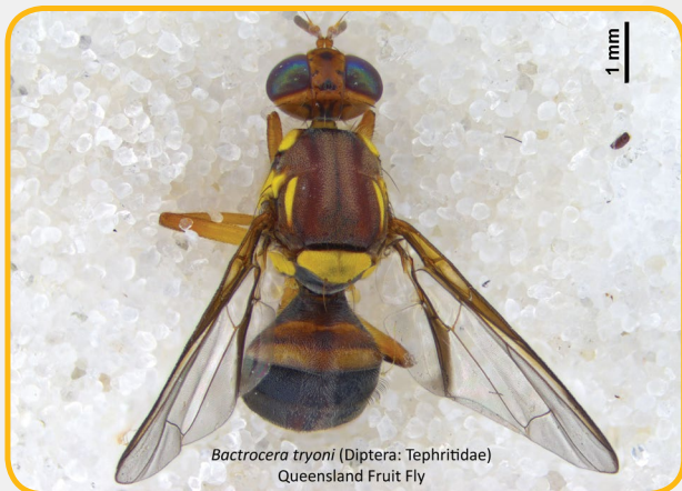
Bactrocera tryoni (Diptera: Tephritidae) Queensland Fruit Fly

Thank you for continuing support as we work to eradicate this biosecurity pest. We can't do it without you.