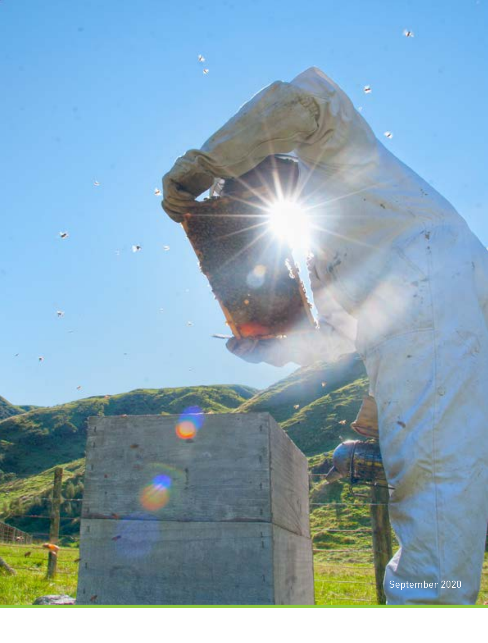
This guide is a summary of the legal requirements for exporting honey and bee products. To access the actual legal requirements go to: <a href="https://www.mpi.govt.nz/law-and-policy/">www.mpi.govt.nz/law-and-policy/</a>